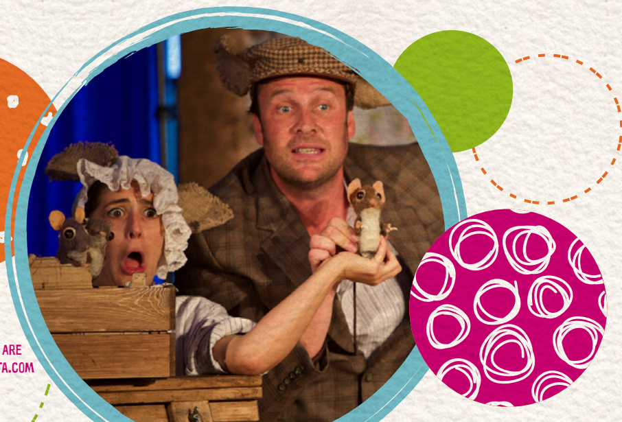
PHOTO CREDITS THROUGHOUT ARE ©SHAUN ARMSTRONG/MUBSTA.COM UNLESS STATED OTHERWISE

AS YOU WILL SEE IT HAS BEEN ANOTHER JAM-PACKED YEAR FOR FULL HOUSE THEATRE WITH LOTS OF ACTIVITY FOR CHILDREN , YOUNG PEOPLE & FAMILIES ACROSS BEDFORDSHIRE & BEYOND! WE DELVED INTO THE LAND OF SOAP OPERAS FOR OUR CHILDREN IN NEED FUNDED PROJECT, THE SECRET STORIES OF HADDOCK FARM , A NEW & EXCITING VENTURE FOR US! THIS WAS FOLLOWED BY OUR FABULOUS FESTIVAL , LUTON'S FULL HOUSE FEB FEST — A FAVOURITE IN THE TEAM'S CALENDAR AND A BIG HIT WITH OUR AUDIENCES.